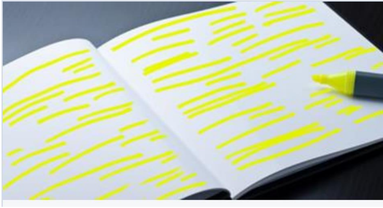
Fig. 3 Hyperlink to further resources

Whats your revision technique? Highlighting is apparently not an evidence based technique Read more http://ideas.time.com/2013/01/09/highlighting-is-a-waste-of-time-the-best-and-worst-learning-techniques/