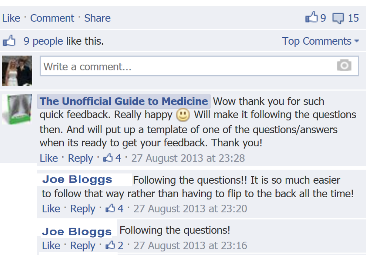
Fig. 2 New book planning

The Unofficial Guide to Medicine shared a link. Posted by Zeshan Qureshi [?] · 12 May